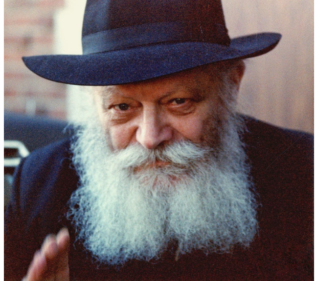
Lubavitcher Rebbe, circa 1987

From 1950 until his death in 1994, Menachem Schneerson, simply known as The Rebbe, led the Chabad Lubavitch Hasidic Jews to become one of the most dynamic forces in Judaism today. Chabad is an acronym for Hesed (“charity”), Binah (“understanding”) and Daat (“knowledge”). Lubavitch is the town in White Russia from where this sect originated. Many followers of Chabad today believe that the Rebbe is the Messiah who will rise from the dead. Today, Chabad is a worldwide movement with more than 4,700 shalichim (“emissaries”) in approximately 100 countries. Their extensive outreach efforts include encouraging secular Jews to return to traditional Judaism through educational programs and seminars, Shabbat dinners, holiday celebrations, and family activities in a welcoming community atmosphere. Chabad embraces Jewish people from all different backgrounds. Due to their outreach efforts, this is the most accessible group of Hasidic Jews, and they are often very open to discussing spiritual matters. Even though our ideas of the Messiah are quite different, there are many points with which we can connect to begin conversations.